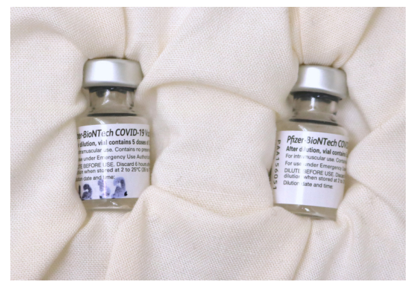
First COVID-19 Vaccine Vials used at Gundersen Health System in La Crosse.