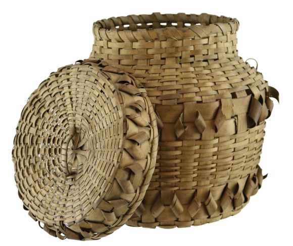
Hoocak (Ho-Chunk) Basket