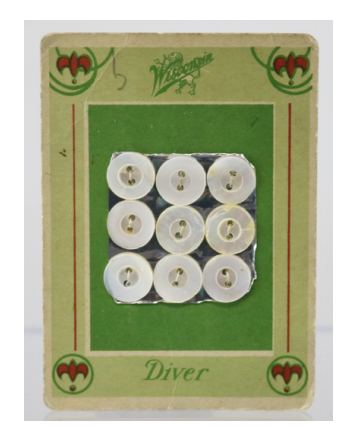
Pearl Button Card from the Wisconsin Pearl Button Co.