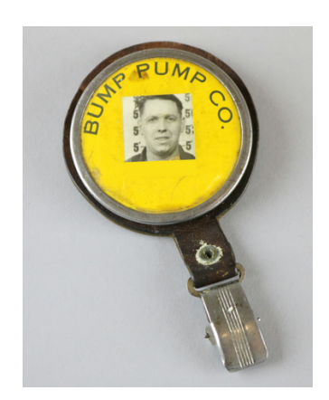
Lyle Monti's ID Badge from the Bump Pump Co.