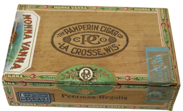
Monna Vanna Cigar Box from Pamperin Cigar Co., 1934.