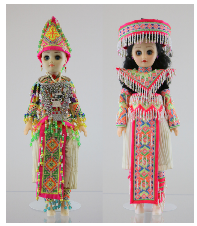
Hmoob (Hmong) Dolls with Handmade Clothing.